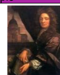
Sir Christopher Wren