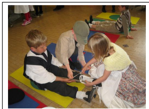
The children finding out about Florence Nightingale

In History we develop a sense of the past. This starts by looking at children's own families and history. Important key events and people are studied such as The Great Fire of London and Florence Nightingale, as well as local historical people including Henry Blogg and Nelson. The children also make comparisons between the past and today through a topic such as Homes. Children are encouraged to use "evidence" such as old photographs, documents and artefacts to develop their understanding of the past. The school has strong links with Aylsham Heritage Centre.